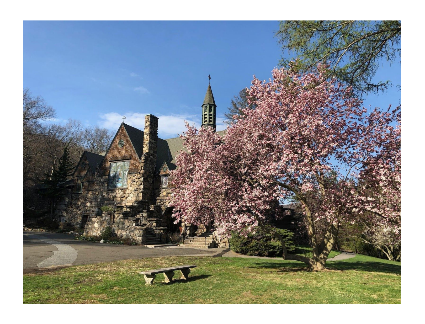
The Holy Eucharist Sundays in Easter 2020